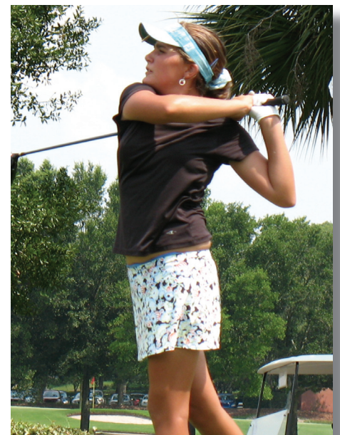
Alexis Thompson advanced to the US Women's Open to become the youngest qualifier for the US Women's Open.